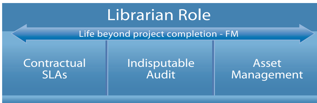
Figure 2: Librarian Role

The potential "owners" of such a system include but are not limited to architects, constructors/project managers, building owners, and reprographic service providers. You will also find that developers/funders, and facilities managers are often part of the mix. Each has a distinctive role and each has a distinctive need for the related content. The point of ownership tends to follow the building lifecycle. Architects, constructors, and project managers require ownership rights in the development stage while facilities managers will take ownership post-development and through to the building's eventual destruction. Each of these participants is also potentially managing their own systems without linkage to the others.